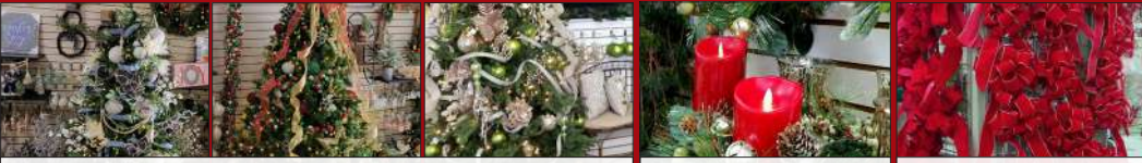
ORNAMENTS, TREE TRIM & MORE