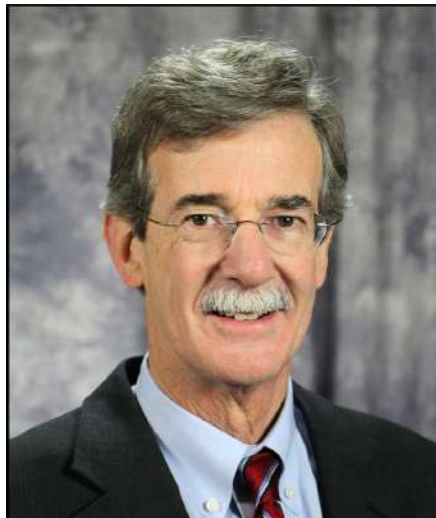
Attorney General Brian Frosh