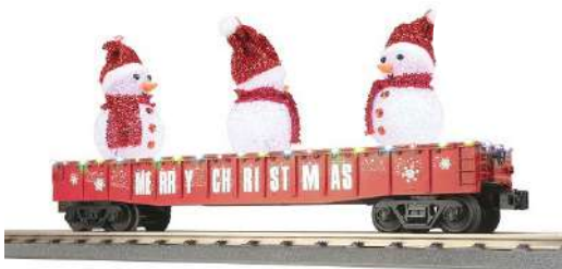
M30-72210 - Gondola Car w/LED Christmas Lights & Lighted Snowmen