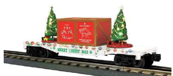
M30-76824 - Flat Car w/Lighted Christmas Trees