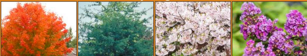
OCTOBER GLORY MAPLE ALL SIZES

Trees for Shade and Spring Color NOW 25% OFF