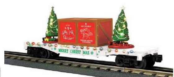
M30-76824 - Flat Car w/Lighted Christmas Trees