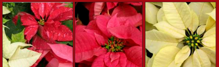
POINSETTIAS - Large selection of colors