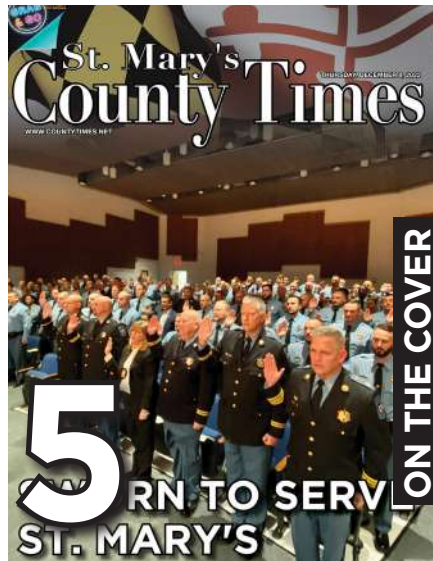
ON THE COVER 5 SHERIFF TO SERVE ST. MARY’S Sheriff’s deputies, elected officials take the oath of office