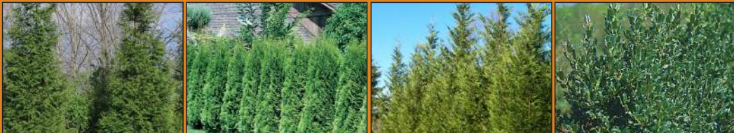
GREEN GIANT ARBORVITAE 3' - 8'