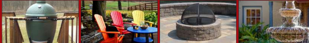
BIG GREEN EGG