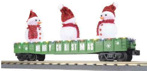
M30-72211 - Gondola Car w/LED Christmas Lights & Lighted Snowmen