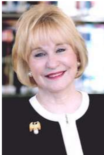
Commissioner-Elect Catherine Grasso