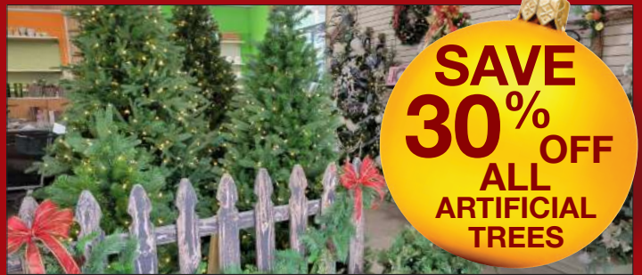
ARTIFICIAL TREES - Various sizes to choose from