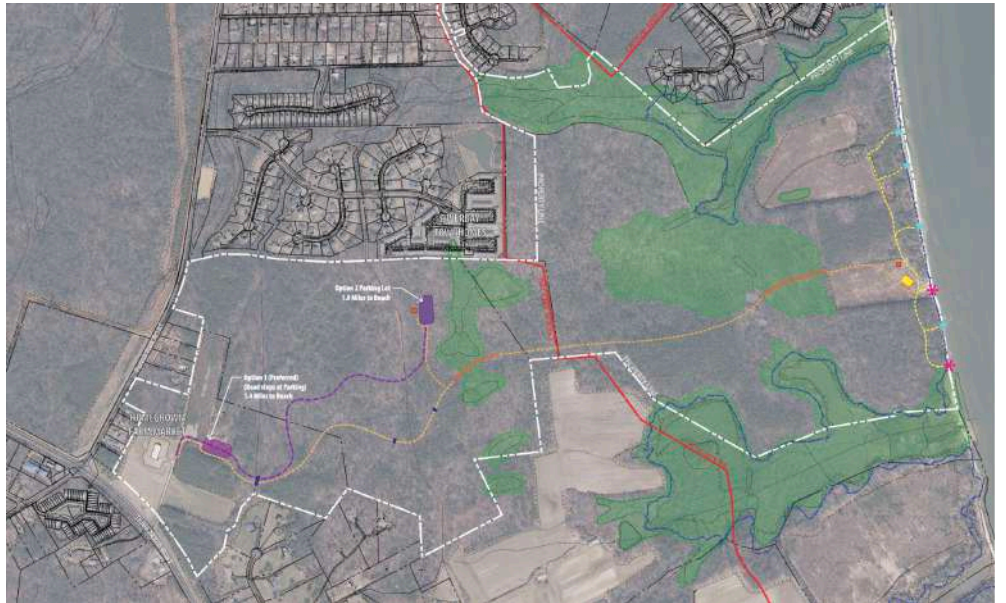
The Shannon Farm property outlined in white

The site is within the resource conservation area (RCA) of the critical area, Mundy added, which has the most stringent rules regarding uses there.