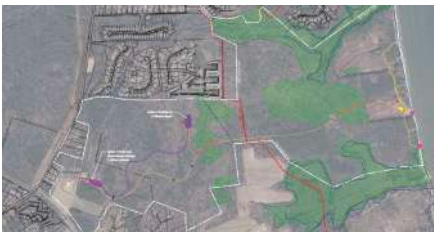
LOCAL 11 Commissioners mull new park plan