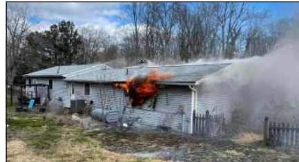
LOCAL 5 Huntingtown fire under investigation

PARK AND SAFETY DIVISION CHIEF AMANDA STILLWAGON ON COVE POINT PARK PLAYGROUND