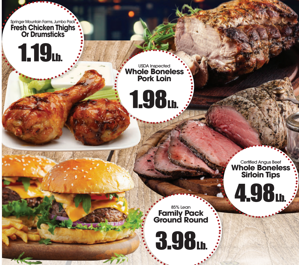
PLATE UP Delicious FLAVOR

Springer Mountain Farms, Jumbo Pack Fresh Chicken Thighs Or Drumsticks