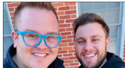
LOCAL 3 Injured emergency responders still in hospital