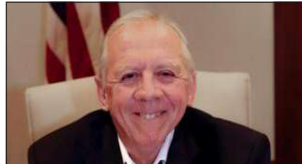
LOCAL 7 Chesapeake Beach mayor presents State of the Town