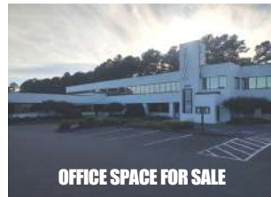
OFFICE SPACE FOR SALE

Charlotte Hall, MD 3 Acres Wooded, Perced