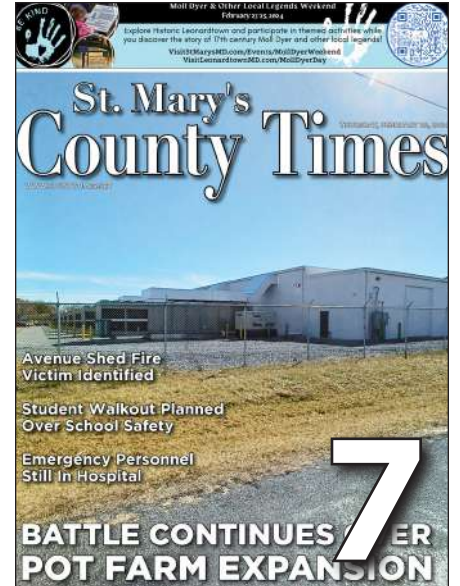
ON THE COVER Bill would return power over cannabis facility expansion back to county