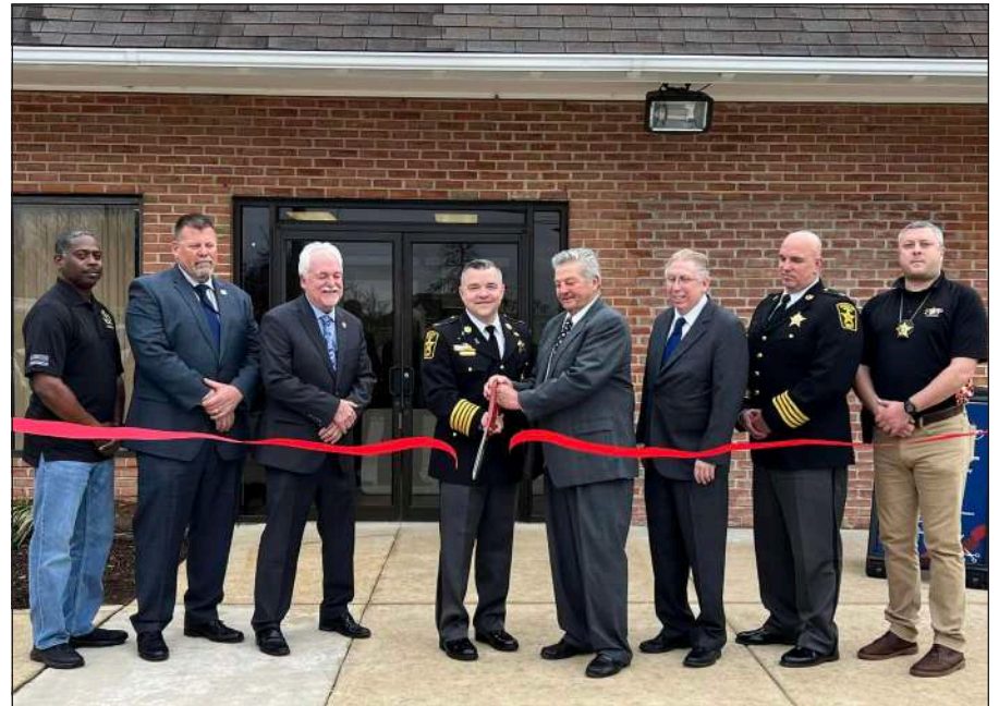
Ribbon cutting at the new district station in Lusby