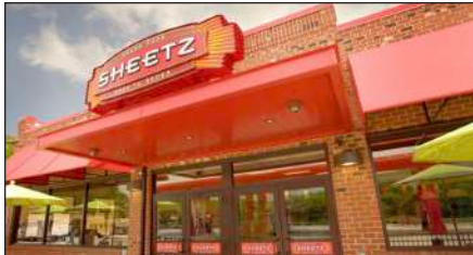
LOCAL 5 Charlotte Hall Sheetz approved