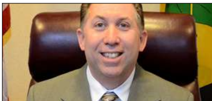
LOCAL 5 Commissioners review transportation plan