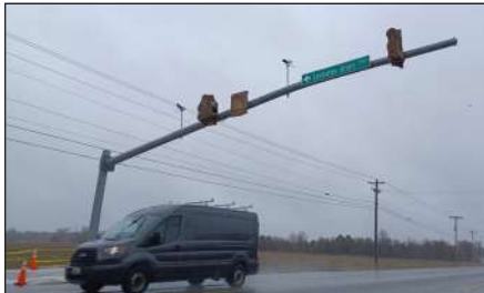
LOCAL 4 New traffic signal in Leonardtown