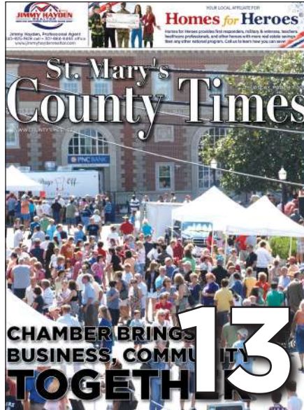
ON THE COVER 13 St. Mary's County Chamber of Commerce celebrates 50 years