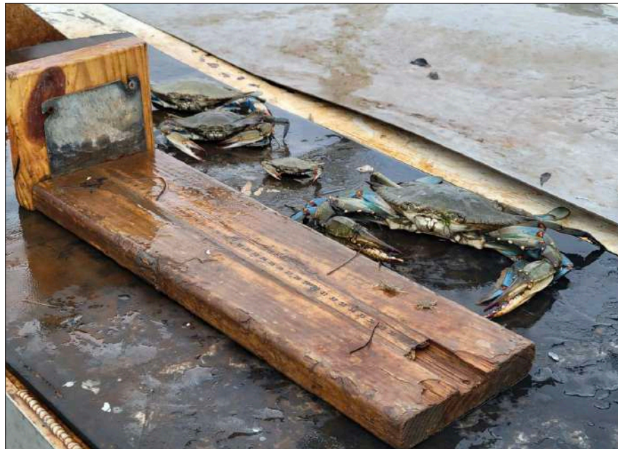
Blue crabs await measurement during the 2024 winter dredge survey.