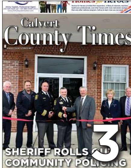
ON THE COVER 3 SHERIFF ROLLS OUT COMMUNITY POLICING New community police stations opened