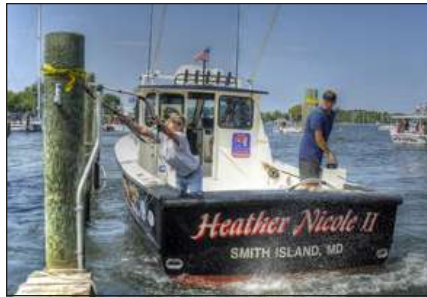
The popular docking competition at the annual Watermen's Festival.