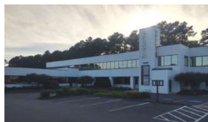
22335 Exploration Drive #1020, Lexington Park 1st Floor Office Condo for SALE!

NOW $325,000.00 $25K REDUCTION! MOTIVATED SELLER! GREAT OPPORTUNITY!