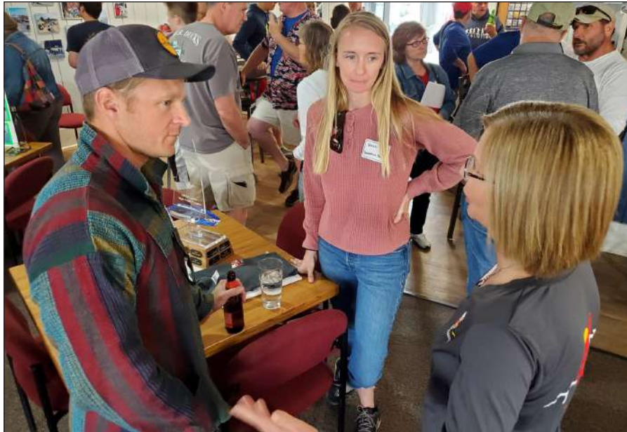
Visitors mingle at last year’s Start Sailing Now Crew Party at Southern Maryland Sailing Association in Solomons.

When SpinSheet held their first Crew Party in Annapolis a couple of decades ago, the focus was on matching race boats in need of crew with people looking go racing. While matching boats with new crew members is still a function of the crew party series, Flaherty says that focus has widened