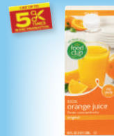
64-Oz., Selected Food Club Orange Juice

SALE PRICE 3.98 DIGITAL COUPON 1.00 OFF TWO FINAL PRICE 2.98