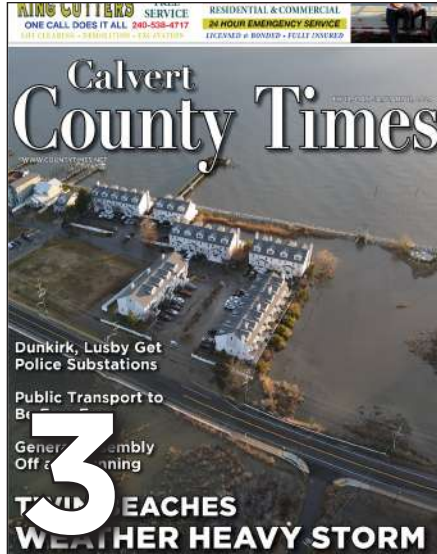
ON THE COVER Twin Beaches weather heavy wind, flooding