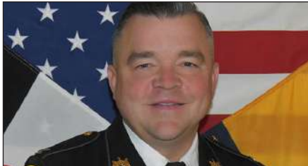
LOCAL 3 Commissioners approve sheriff's substations

SHERIFF COX ON PLANS FOR PATROL DEPUTIES