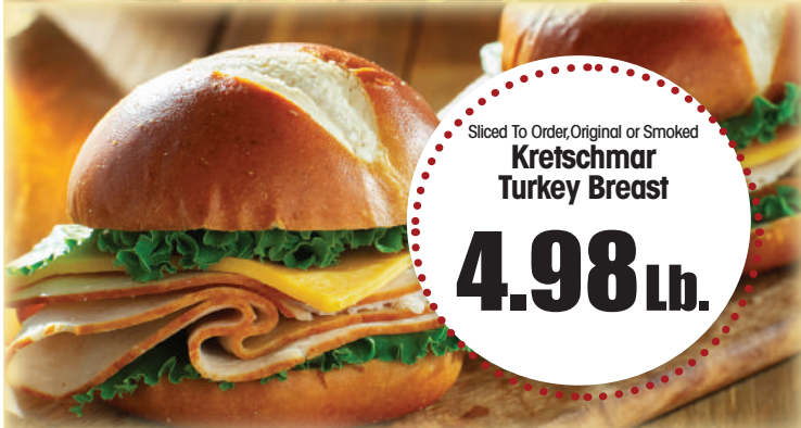
Sliced To Order, Original or Smoked Kretschmar Turkey Breast