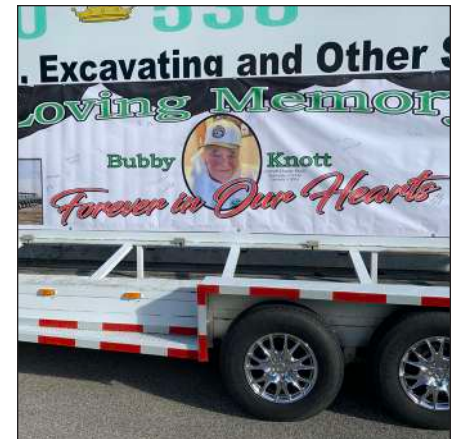
Apparatus from Second District VFD&RS as well as local business, including Knott's own Great Mill Trading Post, assembled at Hollywood VFD on Wednesday in preparation for the funeral procession.