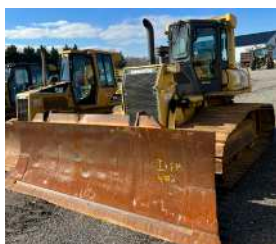
Komatsu 61PX Bulldozer