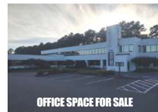
OFFICE SPACE FOR SALE