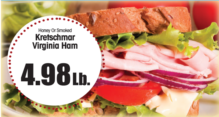
Honey Or Smoked Kretschmar Virginia Ham