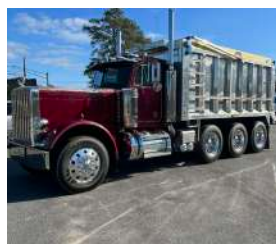
1998 Peterbilt Tri-Axle Dump. Eaton Fuller trans. N14-460F