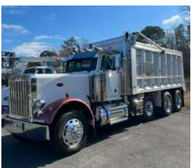
1995 Peterbilt Tri-Axle dump

Two International Tri-Axle dumps with CAT 6NZ engines. 500k miles rebuilt. Five late model wheel loaders. Fifteen bulldozers. Two CAT 963 crawler loaders. One CAT 953 crawler loader. Five skid steers. Skid steer implements. A lot of support equipment.