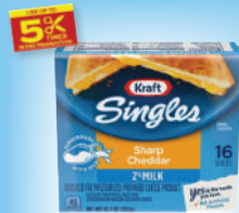
10.7-Oz. Selected Kraft Cheese Singles

SALE PRICE 3.98 DIGITAL COUPON 1.00 OFF TWO FINAL PRICE 2.98