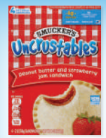
7.2 To 9.98-Oz., Selected Smucker's Uncrustables

SALE PRICE 3.48 DIGITAL COUPON .50 OFF ONE FINAL PRICE 2.98