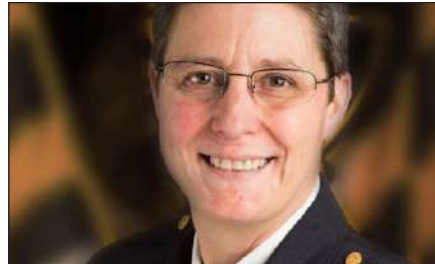
LOCAL 3 New DES director hired