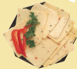
Deli Fresh! Kretschmar Pepper Jack Cheese