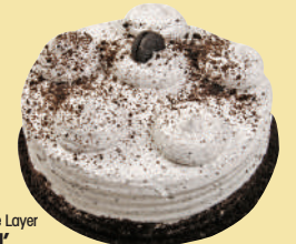
50-Oz., Double Layer Cookies N' Cream Cake