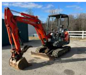
Kubota KK713 Mini-Excavator

Buyer's Premium 10% in person, 12% on-line. For any questions, please contact the office at: (240) 237-8131