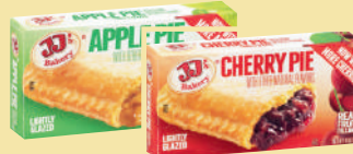
4-Oz., Selected JJ's Fruit Pies