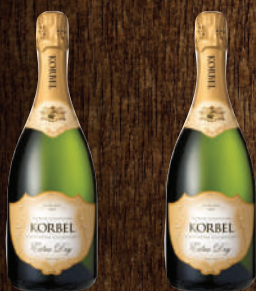
750ml, Extra Dry Korbel Champagne