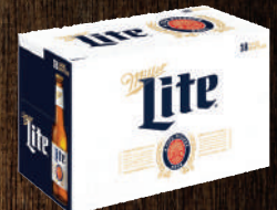
12-Oz. Bottles 18-Pack Miller Lite