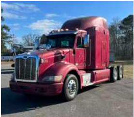
2012 Peterbilt Road Tractor. Sleeper, Cummins LSX 15, automatic

Eight late model tri-axle dump trucks. Several Pickup Trucks. Several farm tractors. Fifteen Excavators. Two Pavers. Two Rollers. Eight new trailers