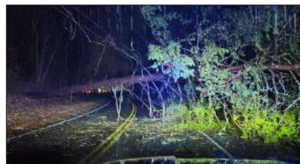
LOCAL 5 St. Mary's recovers from winds, rains