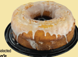
28-Oz., Selected Benson's Pound Cake