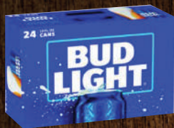
10-Oz. Cans 24 Pack Bud Light