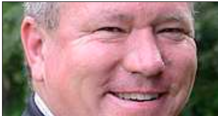
LOCAL 4 Lawmakers reveal General Assembly priorities