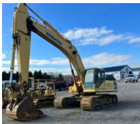
Komatsu PC300LC Excavator