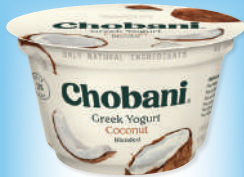
5.3-Oz., Selected Chobani Yogurt