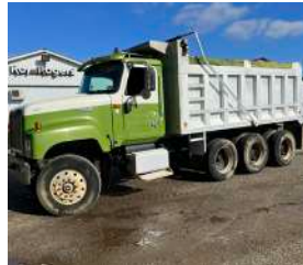
2001 International Tri-Axle Dump, 6NZ Cat engine. Auto trans.

Two International Tri-Axle dumps with CAT 6NZ engines. 500k miles rebuilt. Five late model wheel loaders. Fifteen bulldozers. Two CAT 963 crawler loaders. One CAT 953 crawler loader. Five skid steers. Skid steer implements. A lot of support equipment.