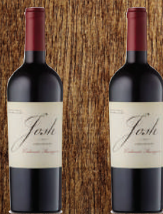
750ml, Cabernet Sauvignon Josh Cellars Cabernet Sauvignon