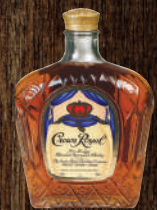
1.75L Crown Royal