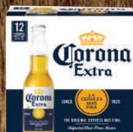
12-Pack Bottles Corona Extra Light