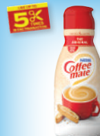
32-Oz. Selected Coffee Mate Creamer

SALE PRICE 3.98 DIGITAL COUPON 1.00 OFF TWO FINAL PRICE 2.98