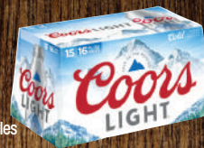
16-Oz. Aluminum Bottles 15-Pack Coors Light