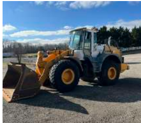
Liebherr 544 Wheel Loader