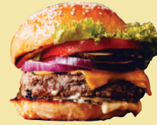
Deli Fresh! Kretschmar Yellow American Cheese