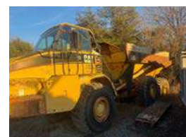
CAT 725 Articulated Haul Truck w/tailgate - low hours