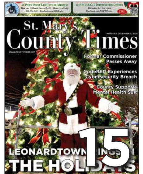
ON THE COVER Christmas on the Square ushers in the holiday season