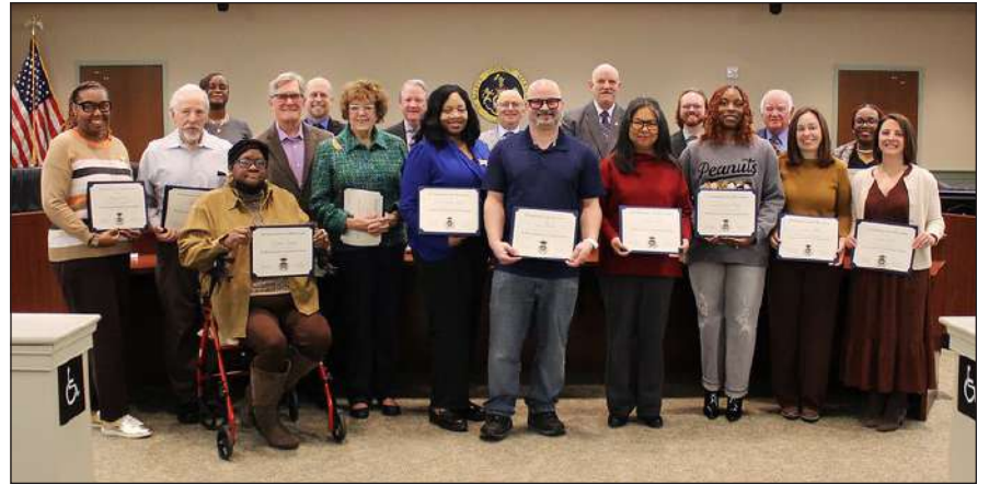
Citizens Academy graduates who appeared at the Dec. 2 commissioner meeting