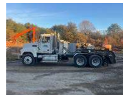
CH Mack 427 & LL8