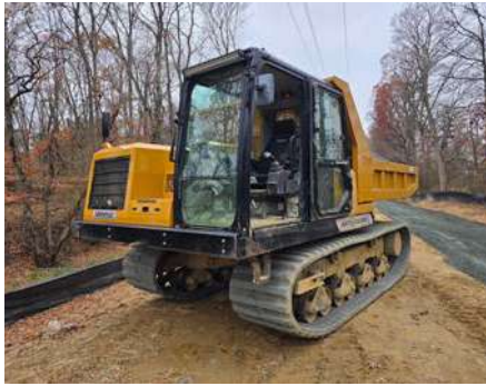
Morooka MST2200VD 2 units - Low Hours