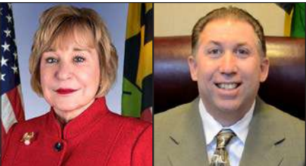
LOCAL 6 Prince Frederick plan delayed again