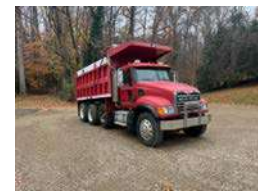
Mack Granite Tri Axle Dump 1 of 10