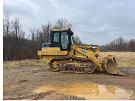
CAT 963C w/3 rd Valve Low Hours. 2 units.