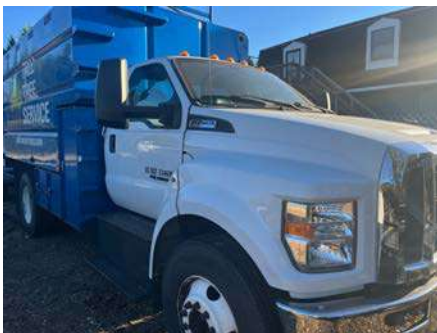
2019 F750 Dump Chipper Truck CDL Deisel - Low miles.