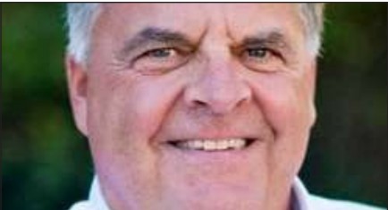
LOCAL 4 Commissioners propose nearly doubling county treasurer’s salary