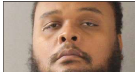
COMMUNITY 12 Convictions made in massive 2024 drug bust