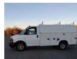
2021 Chevy Truck w/utility body. X2

15 Tri Axle dump trucks 10 Road Tractors 20 Heavy duty trucks 40 Light pickups 15 utility trailers 2 air-brake tag along 10 ton trailers 55 ton detach non-ground bearing trailer 200 Lots of support equipment