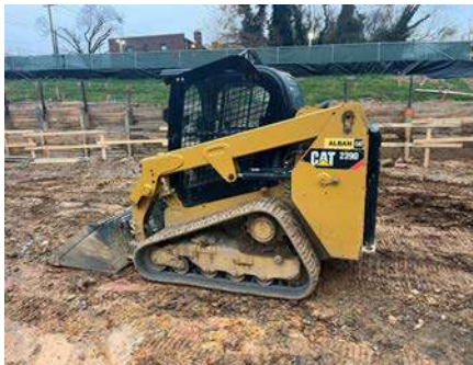
CAT 239D Skid Steer Low Hours