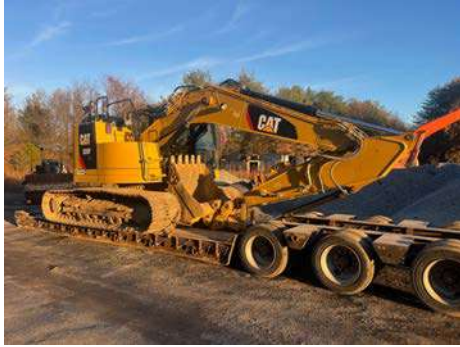
CAT 325FL Excavator

Majority of the equipment has low hours & is in very good condition