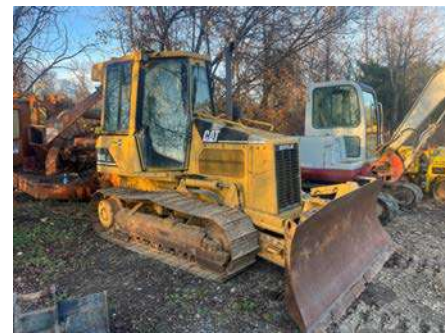
D4GXL Bulldozer - 2800 hours Cabin w/air and heat

10 tri axle Mack dump trucks 2006 & 2007 w/Md certification. J&J steel body. 2 automatics rest are 8LL Manuals