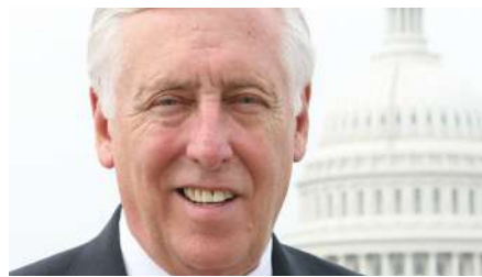
LOCAL 4 Hoyer secures funding

“THE MORE THINGS CHANGE, THE MORE THEY STAY THE SAME.” FRENCH WRITER JEAN-BAPTISTE ALPHONSE KARR IN 1849