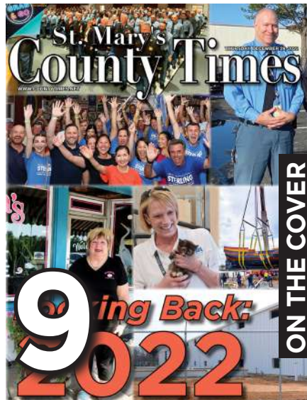
St. Mary's saw much change in 2022