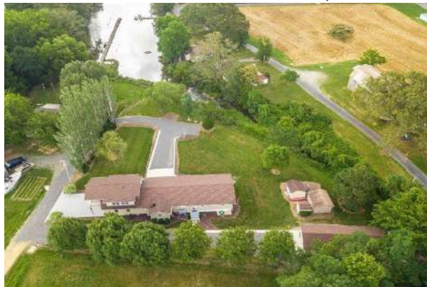
Bernie Lawrence Lane in Abell, MD

7th Heaven Waterfront on 1.5 acres. Recently remodeled 4 brm/4 bath, detached in-law apartment, 2 car garage, large custom workshop and outbuildings with lots of storage.