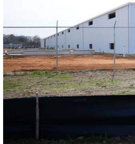
The cannabis facility in Avenue

District 5 is held by U.S. Rep. Steny Hoyer and includes Calvert, St. Mary’s