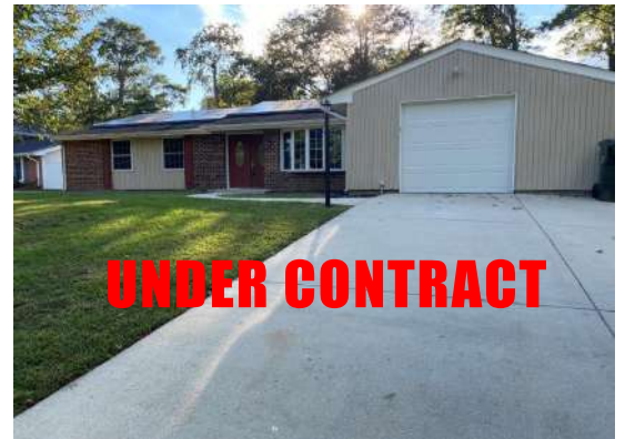
Temi Drive (Pinefield) in Waldorf, MD

Updated 4 brm/2 bath home in Pinefield, large kitchen with stainless appliances, large living room w/hardwoods & bay window. Lots of room for family & entertaining.