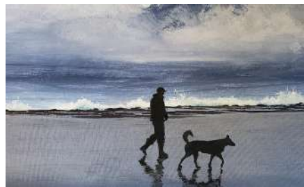
LOCAL 8 North Beach hosts art exhibit