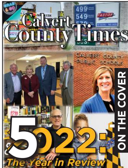
Calvert got new commissioners, sheriff in 2022