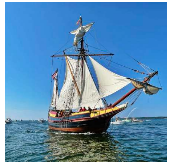
The new Maryland Dove arrived in St. Mary’s City

Shipwrights said submarine research of ship wrecks at the bottom of the ocean over the centuries have given them