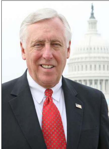
Congressman Steny Hoyer

Congressman Steny H. Hoyer (MD-05) on Dec. 26 released the following statement following House passage of the 2023 Fiscal Year Omnibus legislation, announcing over $16,125,150 in Community Project Funding for Fifth District priorities. This total is in addition to the more than $13,000,000 that Congressman Hoyer secured for projects in the Fifth District in the FY22 Omnibus. The House Committee on Appropriations allowed each Member of Congress to submit up to 15 Community Funding Project requests for their districts in the Fiscal Year 2023 funding bill. As part of that process, Congressman Hoyer solicited requests on his website and submitted 15 projects to the House Appropriations Committee.