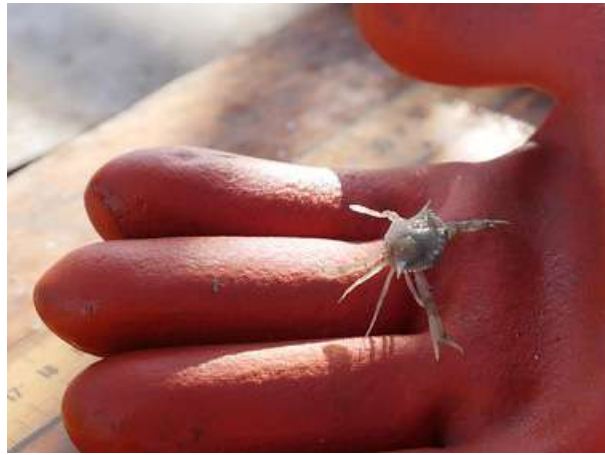
Crab populations cratered this year

Overall, the total population of Maryland hard crab has dwindled to what