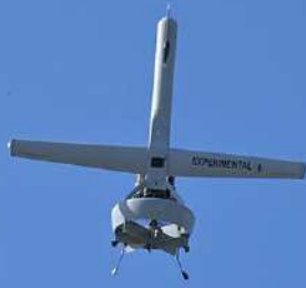
V-BAT 128 DEMONSTRATOR