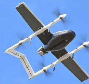
SKYWAYS V2.6B DEMONSTRATOR

The Naval Air Warfare Center Aircraft Division (NAWCAD) recently demonstrated multiple unmanned systems in a first-of-its-kind mission to move supplies to ships at sea without the use of manned aircraft during an event at Naval Air Station Patuxent River in St. Inigoes, Maryland.