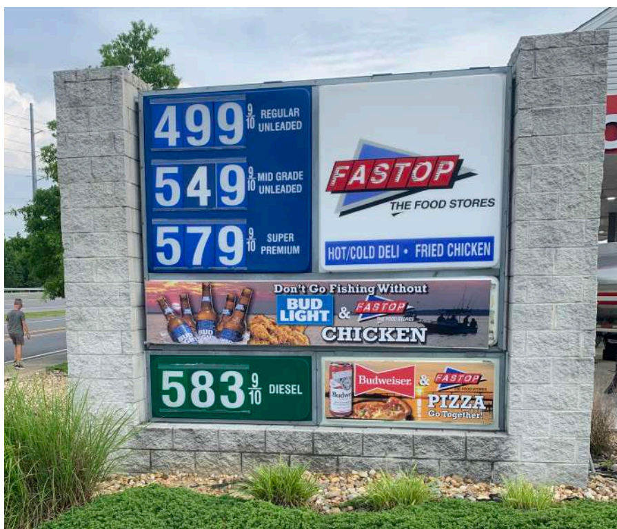
Gas prices skyrocketed in 2022