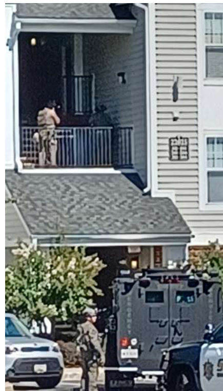
A SWAT standoff in Lexington Park