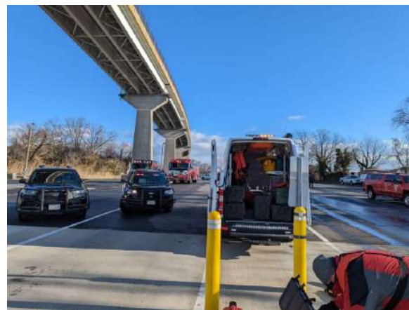
Dive & Rescue units responded to bridge jumpers

There were other violent deaths that deeply shoot the community and led leaders to call for action from the state; suicidal jumpers from the Gov. Thomas Johnson Bridge.