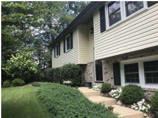
Bach Drive in Charlotte Hall, MD

Location! Location! Charlotte Hall. Spacious 4 bedroom 3 bath, 16x20 sunroom, eat in kitchen with Amish made cabinets, fully improved basement & new septic (2022).