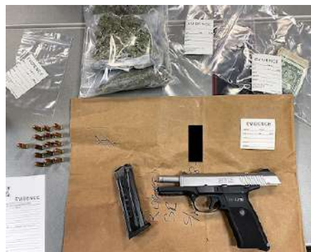
Guns and drugs are part of the criminal culture leading to growing violence