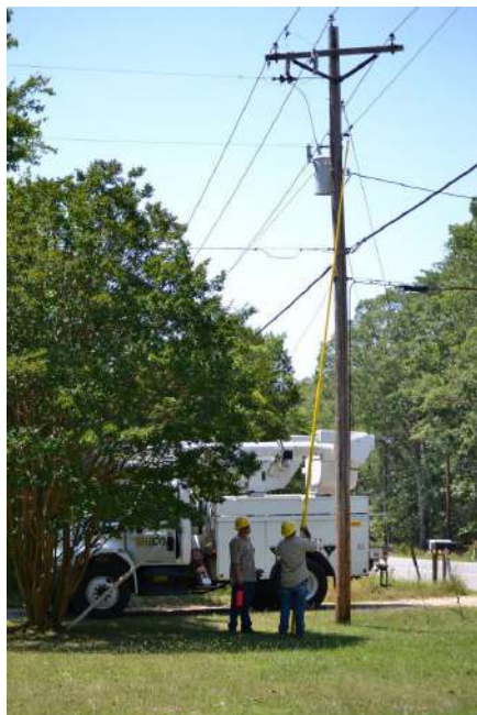
SMECO's rate hikes drew outrage

The snow began to fall late into the night of Jan. 2 and continued on into the