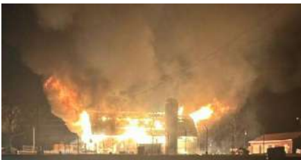
LOCAL 5 Barn fire under investigation