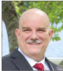
Commissioner Scott Ostrow