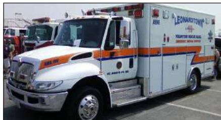
LOCAL 5 Two rescue squads want higher taxes