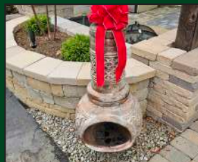
Chimineas Perfect for Deck or Patio - All 30% Off