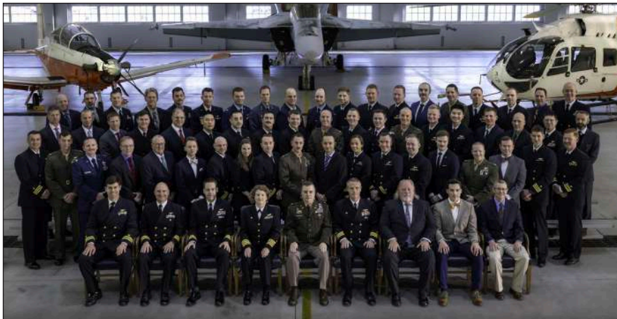
A graduation ceremony recognizing the 31 students from U.S. Naval Test Pilot School's Class 165 was held Friday, December 13, 2024 at Naval Air Station Patuxent River in Maryland. The new test pilots, flight officers, engineers, and international partners represent eight different military organizations and four government agencies worldwide.

The United States Naval Test Pilot School (USNTPS) held a graduation ceremony for Class 165 on Dec. 13. Thirty-one students successfully completed the intense, 11-month course of instruction and received their designations as Engineering Test Pilots, Engineering Test Flight Officers and Test Project Engineer.