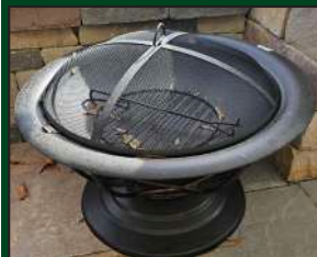
Portable Fire Pits 20% Off Any Size