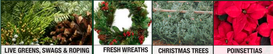
LIVE GREENS, SWAGS & ROPING FRESH WREATHS CHRISTMAS TREES POINSETTIAS