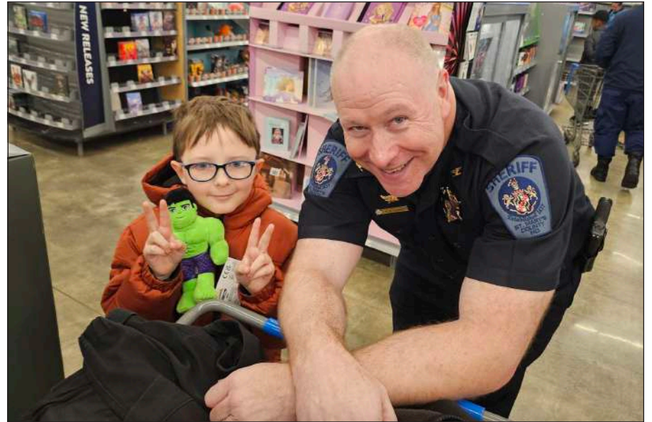
On Dec. 14, 108 children were able to shop for Christmas gifts for themselves and their families through the St. Mary's County Shop with a Cop Program.