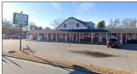
LOCAL 8 Bar's liquor license revoked