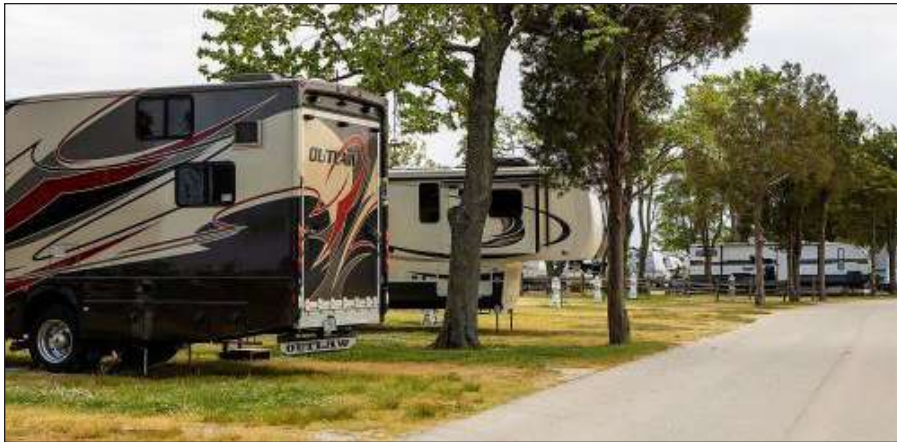
Breezy Point Campground