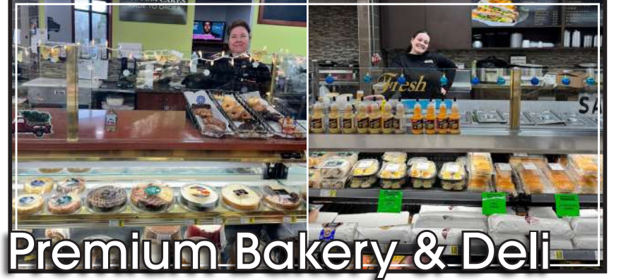
Premium Bakery & Deli