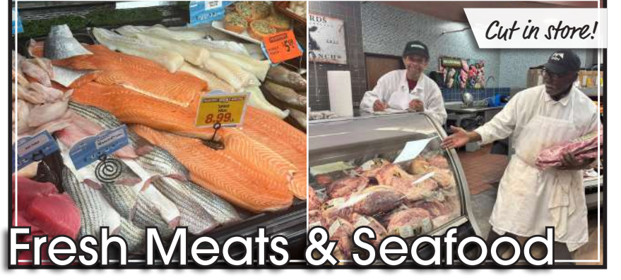
Fresh Meats & Seafood