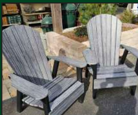
Adirondack Weather Proof Chairs Buy 2 Save $100

Wentworth Nursery CHRISTMAS SEASON COUPON GOOD THROUGH DECEMBER 24, 2024