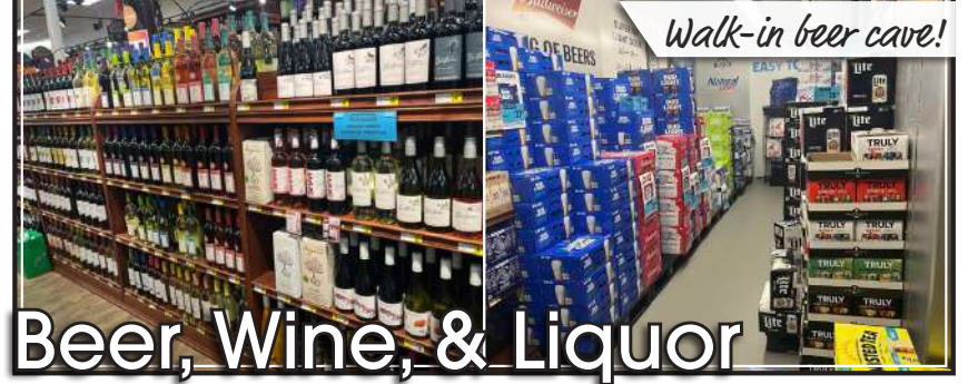
Beer, Wine, & Liquor

23860 Hollywood Road, Hollywood, MD 20636 www.BradfordsMarket.com | 301-475-2531