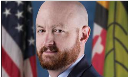
LOCAL 4 Planners to consider data center restrictions