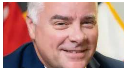
LOCAL 7 Speakers oppose cutting social workers from school budget