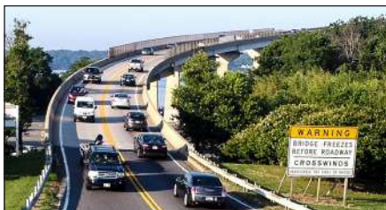
LOCAL 6 County shares transportation priorities