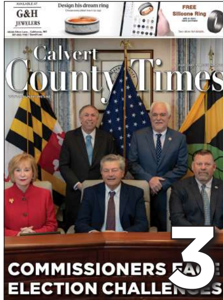
ON THE COVER 3 COMMISSIONERS FACE ELECTION CHALLENGES All five commissioners face challengers in re-election bids