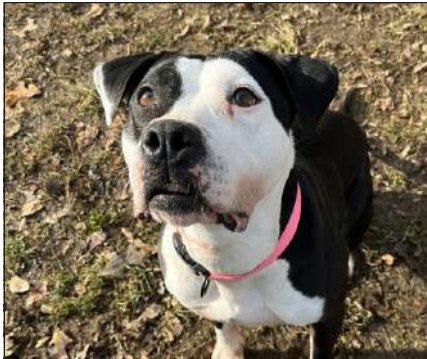
A few of the animals currently available for adoption. Clockwise from top left are Rockey, Seahawk, Malie Marie, and Theodore.

Celebrate St. Patrick's Day by bringing home your own lucky charm. The Linda L. Kelley Animal Shelter is offering $17 adoptions for all cats and dogs to qualified adopters during their Fur-Leaf Clover Adoption Event, from Tuesday, March 10, through Tuesday, March 17.