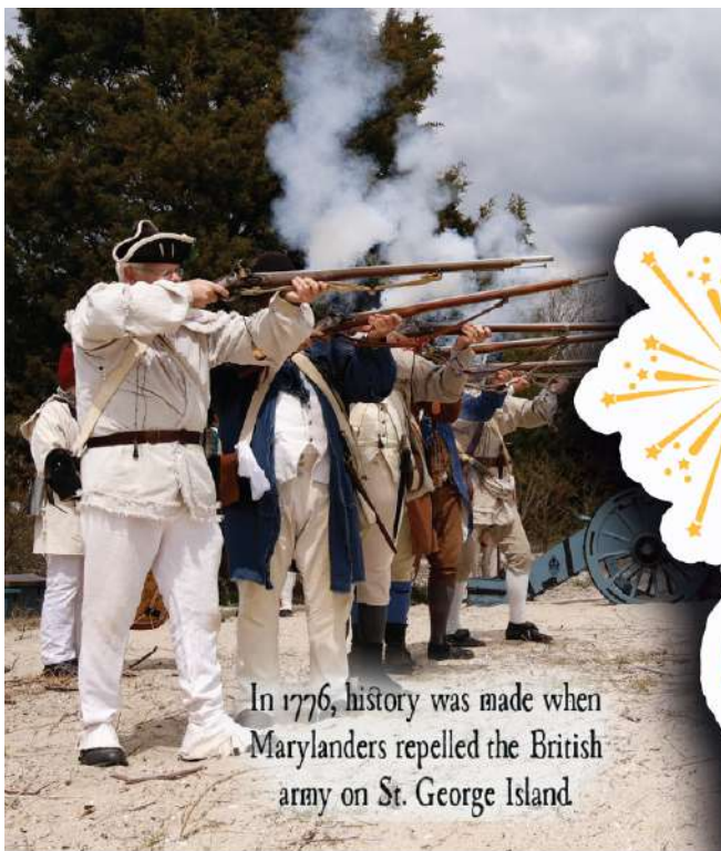
In 1776, history was made when Marylanders repelled the British army on St. George Island.