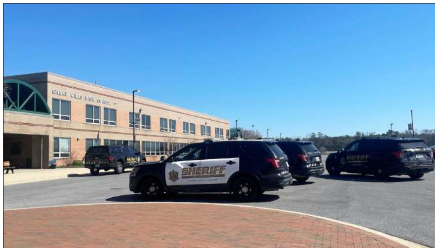
Police response to Great Mills High School following Tuesday's stabbing.

Deputies from the St. Mary's County Sheriff's Office are investigating a stabbing that occurred Tuesday, March 10 at Great Mills High School.